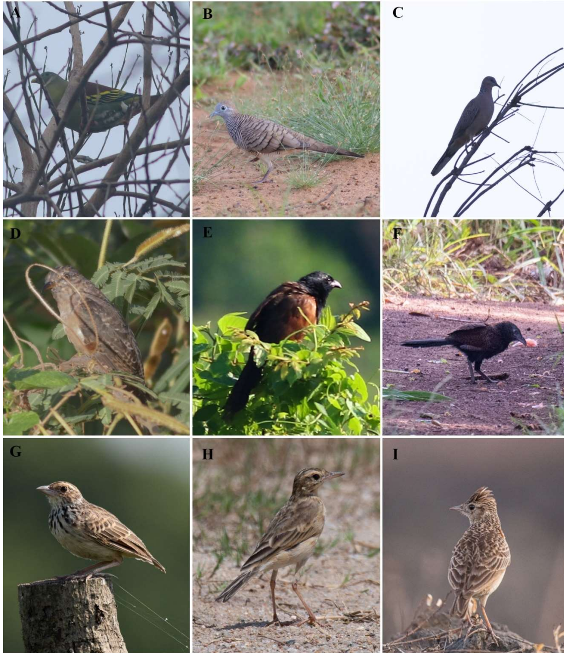
Plate 3: (A) Treron curvirostra ; (B) Geopelia striata ; (C) Spilopelia chinensis ; (D) Cacomantis merulinus ; (E) Centropus bengalensis ; (F) Centropus sinensis ; (G) Mirafra erythrocephala ; (H) Anthus rufulus ; (I) Alauda gulgula .