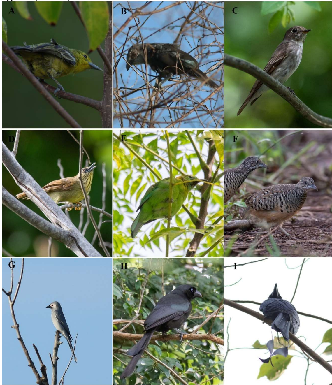
Plate 7: (A) Aegithina tiphia ; (B) Phaenicophaeus tristis ; (C) Muscicapa dauurica ; (D) Mixornis gularis ; (E) Chloropsis moluccensis ; (F) Turnix suscitator ; (G) Dicrurus leucophaeus ; (H) Crypsirina temia ; (I) Dicrurus paradiseus .