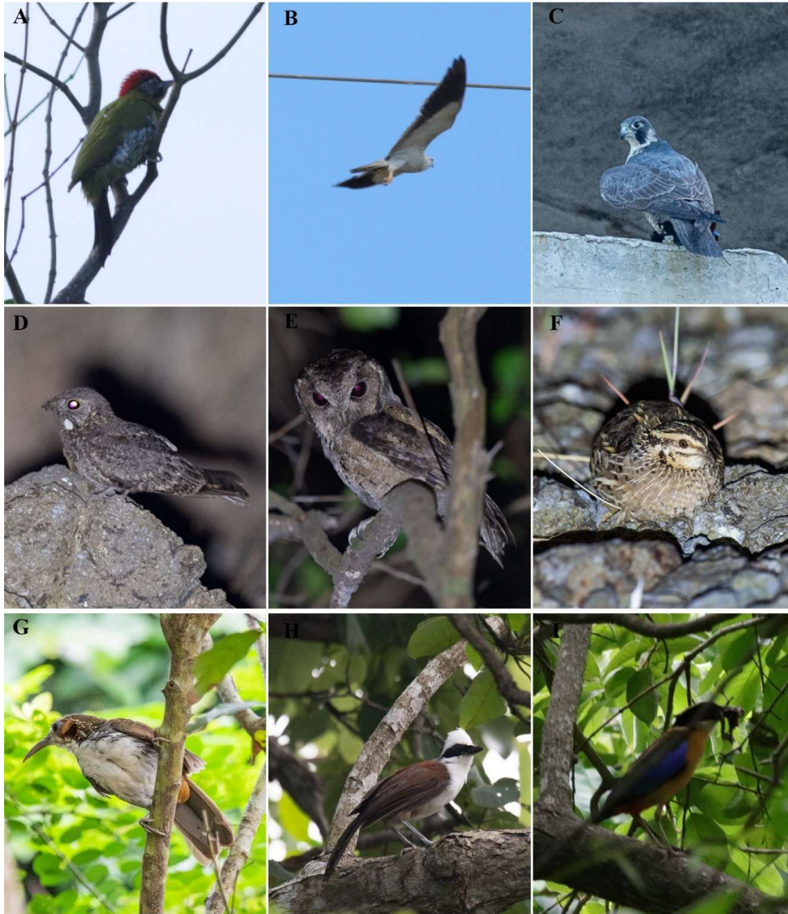
Plate 5: (A) Picus vittatus ; (B) Elanus caeruleus ; (C) Falco peregrinus ; (D) Caprimulgus affinis ; (E) Otus lettia ; (F) Coturnix coromandelica ; (G) Erythrogonys hypoleucos ; (H) Garrulax leucolophus ; (I) Pitta moluccensis .