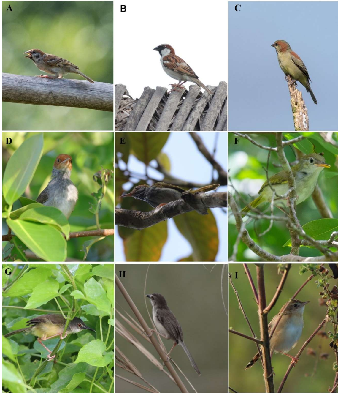
Plate 1: (A) Passer montanus ; (B) Passer domesticus ; (C) Passer flaveolus ; (D) Orthotomus ruficeps ; (E) Orthotomus atroregularis ; (F) Orthotomus sutorius ; (G) Prinia flaviventris ; (H) Prinia inornata ; (I) Cisticola juncidis .

Appendix: Images of birds recorded during this study in Ba Ria Vung Tau Province, Vietnam.