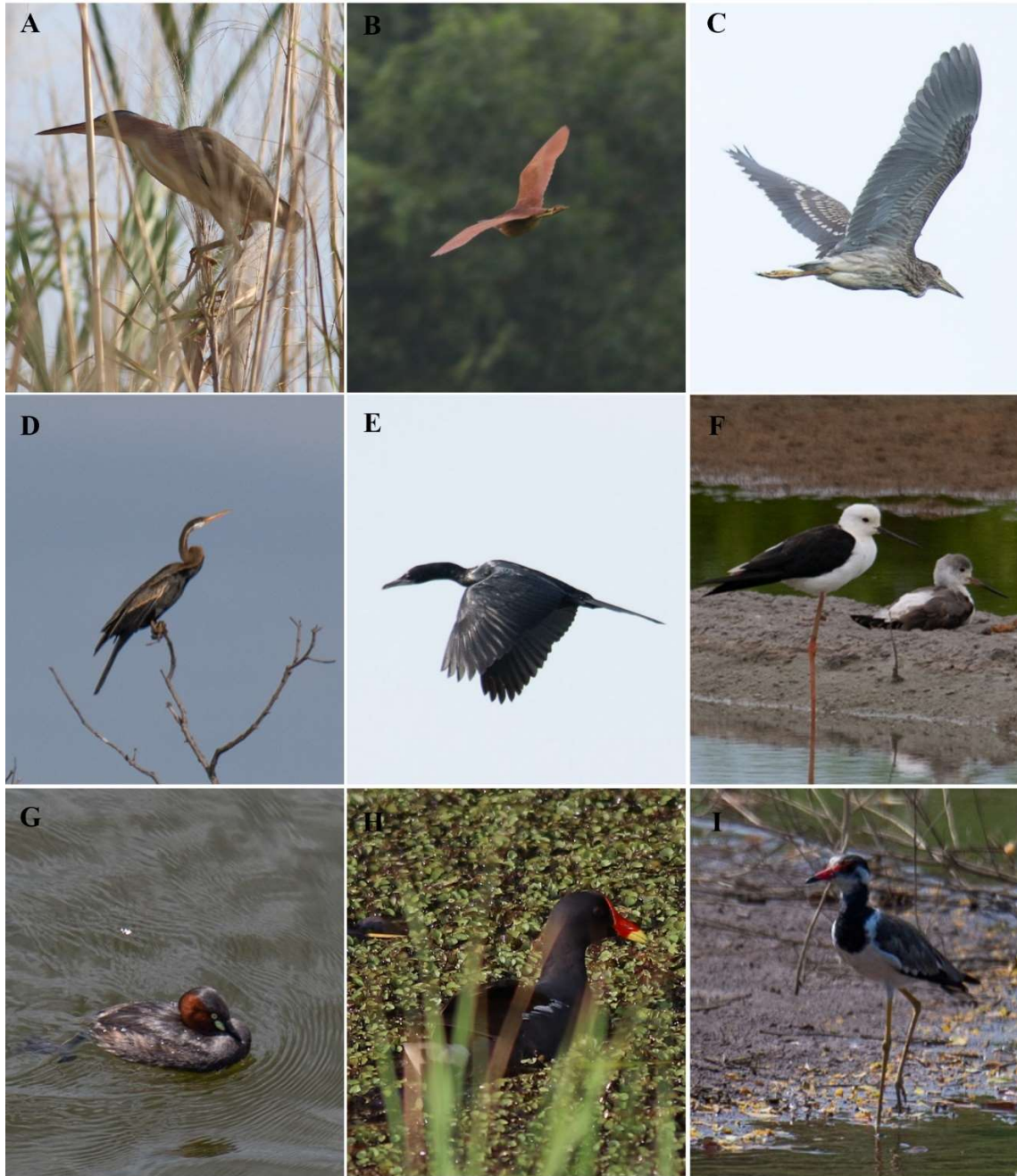
Plate 6: (A) Ixobrychus sinensis ; (B) Ixobrychus cinnamomeus ; (C) Nycticorax nycticorax ; (D) Anhinga melanogaster ; (E) Microcarbo niger ; (F) Himantopus himantopus ; (G) Tachybaptus ruficollis ; (H) Gallinula chloropus ; (I) Vanellus indicus .