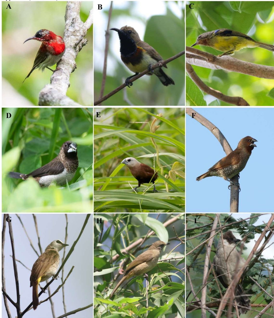
Plate 2: (A) Aethopyga siparaja ; (B) Cinnyris ornatus ; (C) Anthreptes malacensis ; (D) Lonchura striata ; (E) Lonchura maja ; (F) Lonchura punctulata ; (G) Pycnonotus goiavier ; (H) Pycnonotus conradi ; (I) Pycnonotus aurigaster.