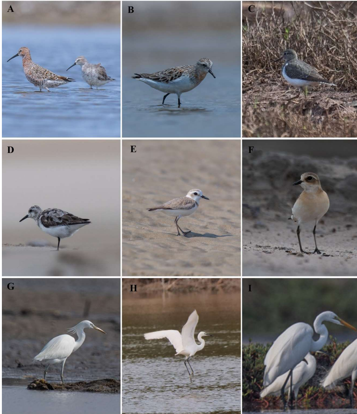
Plate 9: (A) Calidris ferruginea ; (B) Calidris ruficollis ; (C) Actitis hypoleucos ; (D) Calidris alba ; (E) Charadrius alexandrinus ; (F) Charadrius mongolus ; (G) Egretta eulophotes ; (H) Egretta garzetta ; (I) Ardea alba .