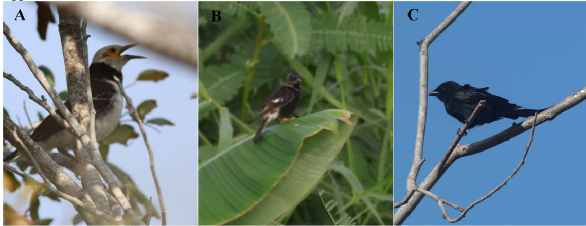
Plate 11: (A) Gracupica nigricollis ; (B) Saxicola caprata ; (C) Dicrurus macrocercus .