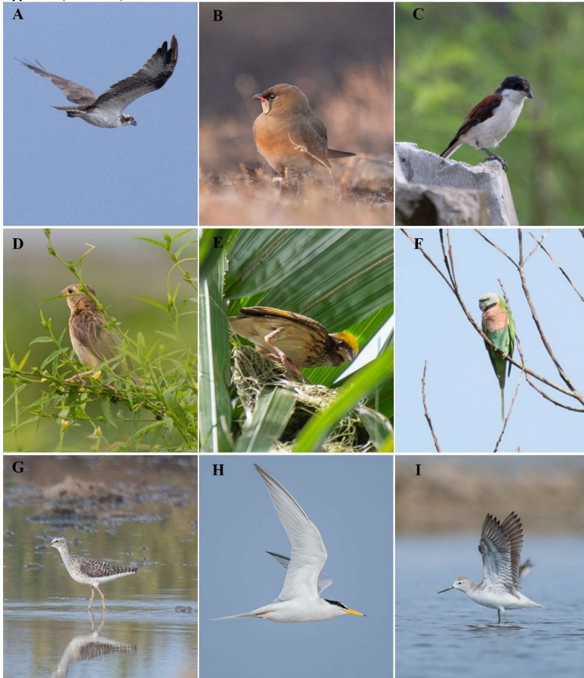
Plate 8: (A) Pandion haliaetus ; (B) Glareola maldivarum ; (C) Lanius collurioides ; (D) Ploceus philippinus ; (E) Ploceus manyar ; (F) Psittacula alexandri ; (G) Tringa glareola ; (H) Sternula albifrons ; (I) Tringa stagnatilis .