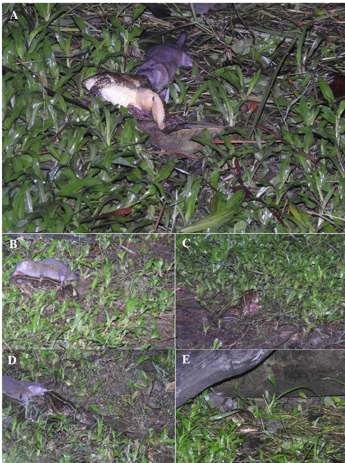
Figure 2: Observations on Suncus murinus feeding on Hoplobatrachus tigerinus : the shrew chewing on the frog (A), the shrew grabbing the frog and further chewing (B), when disturbed by the light the shrew left the prey (C), the shrew started dragging the frog towards a hideout under some wood (D and E).