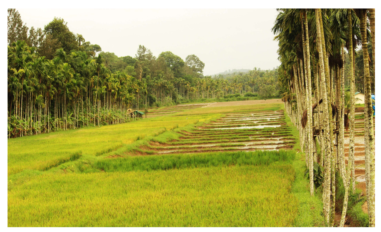
Figure 3: Paddy fields in the midst of coffee, arecanut, coconut plantations (Regional Agricultural Research Station, Ambalavayal), a habitat of collection of I. longicephalus .