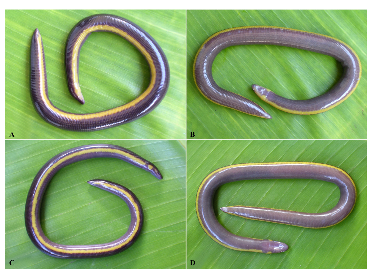
Figure 4: Congeneric species of Ichthyophis co-inhabiting along with Ichthyophis longicephalus in peninsular India: Ichthyophis beddomei , dorsal (A) and ventral (B) views; dorsum (C) and ventrum (D) of Ichthyophis kodaguensis .

1870)) (Malathesh et al., 2002; Venu and Venkatachalaiah, 2006) and one Uraeotyphlus (Venu pers. observ.).