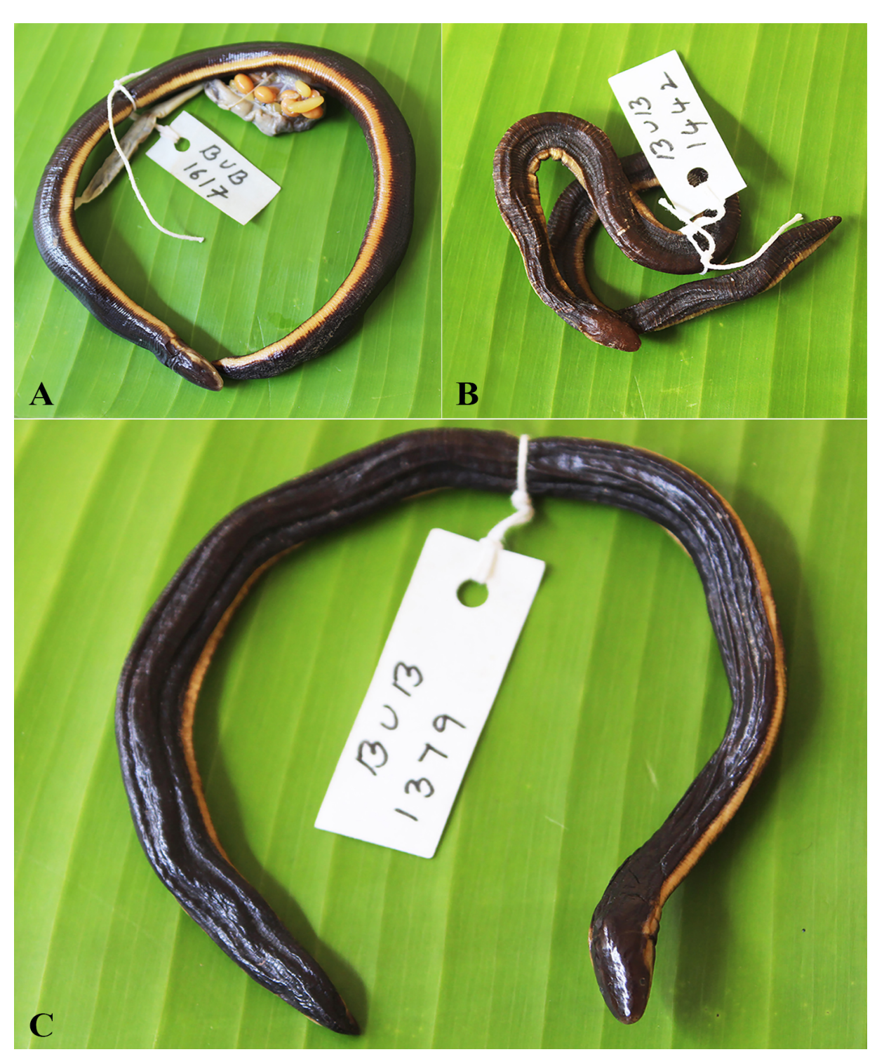
Figure 2: Adult specimens of Ichthyophis longicephalus collected from Regional Agricultural Research Station, Ambalavayal, BUB1617 (A), Kuchikunnel tea plantations, Gudalur, BUB1442 (B) and Himakshama estate, Jodupala-Made village, BUB1379 (C).

Two specimens of I. beddomei were collected from the estate and the site of collection was about 100 m away from the site of I. longicephalus .