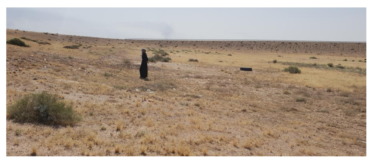
Figure 2: The habitat of Latrodectus dahli Levi, 1959 in Al-Rumaila, Al-Shamalia, Basra, Iraq.