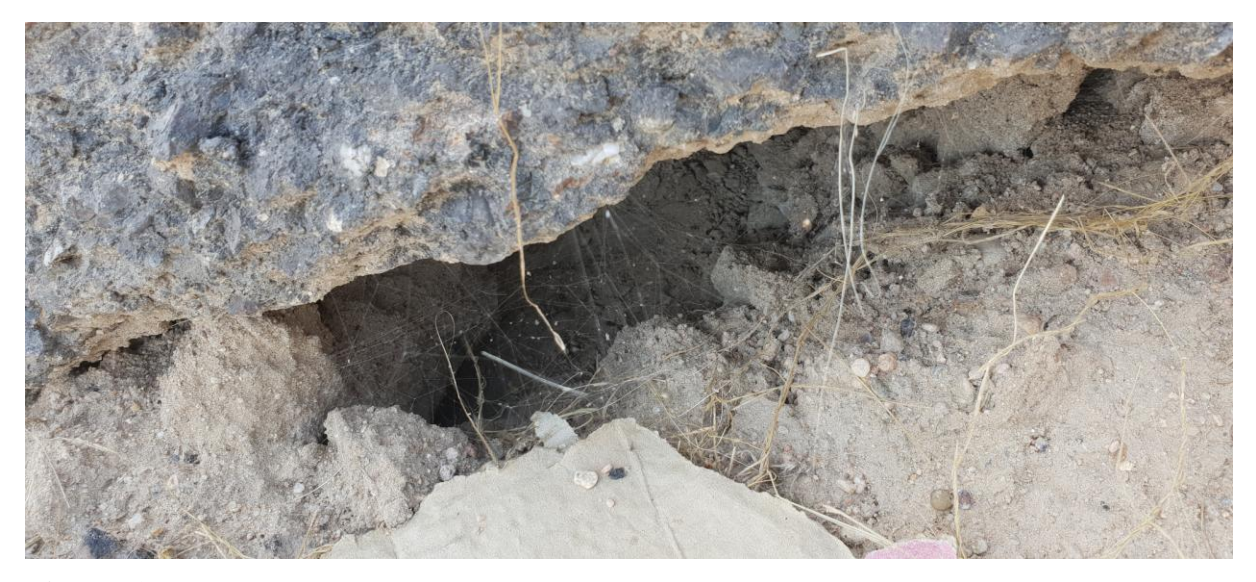
Figure 3: The habitat of Latrodectus dahli Levi, 1959 with its scaffold web, from Al-Rumaila, Al-Shamalia, Basrah, Iraq.

Latrodectus dahli is similar to L. hystrix Simon, 1890 in the female internal duct system but differs in the shape and coloration of the opisthosoma (Knoflach and van Harten, 2002: pl. 49–52).