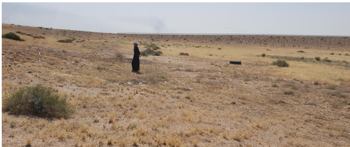
Figure 2: The habitat of Latrodectus dahli Levi, 1959 in Al-Rumaila, Al-Shamalia, Basra, Iraq.