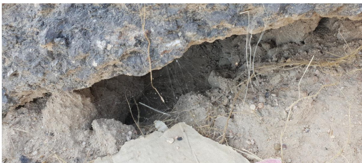
Figure 3: The habitat of Latrodectus dahli Levi, 1959 with its scaffold web, from Al-Rumaila, Al-Shamalia, Basrah, Iraq.

Latrodectus dahli is similar to L. hystrix Simon, 1890 in the female internal duct system but differs in the shape and coloration of the opisthosoma (Knoflach and van Harten, 2002: pl. 49–52).