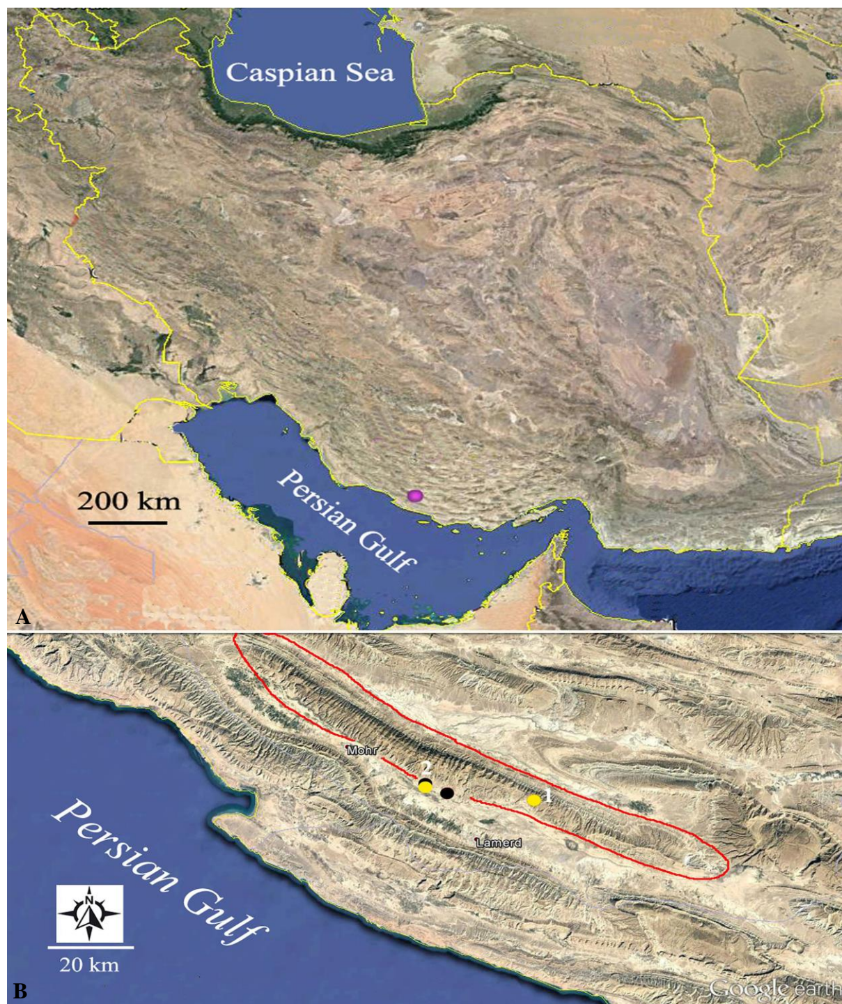
Figure 2: Map of Iran (A) showing the location of Hemiechinus auritus (pink circle) at Varavi District in Fars Province; selected section of Iran map along the Persian Gulf (B) showing Varavi Mountain with red line, and new localities of H. auritus (yellow circles 1 and 2) and Paraechinus hypomelas (black circles), respectively.

The results of this study are based on several scattered field observations in southern and western Iran. Figure 2 shows the localities of new records in Mohr and Lamerd Counties in the southwest of Fars Province, southern Iran.