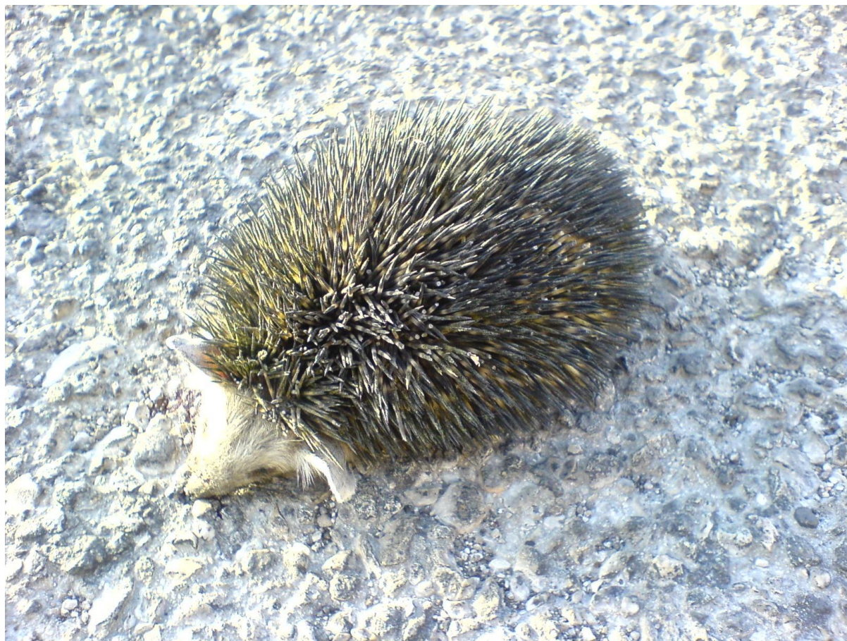
Figure 3: A Hemiechinus auritus on the road surface killed by motor vehicle, in Lamerd region, southwestern Fars Province.

Subsequently, the first author as a zoologist has had a more scientific focus on the mammals of Fars Province, noting where hedgehog specimens were found at the night in desert areas or were killed on the roads by motor vehicles (Fig. 3). Most of the observed specimens were blackish (Fig. 4) but in rare cases they were yellowish. One H. auritus individual (Fig. 3) was found dead on 25 March 2008 in the “Chah Shour Pass” (27°25'56.38"N; 53°18'30.41"E), a mountain pass in the southern Zagros Mountains, about 15 km from the city Lamerd, capital of Lamerd County in southwest of Fars Province (Fig. 2). Its habitat, part of Varavi Mountain, grows on calcareous soils with scattered bushes and trees. The second H. auritus (Fig. 5) was found during the night on 22 July 2018 in Varavi City (27°27'51"N; 53°3'44"E), Mohr County in southwest of Fars Province. The northeast end of the city is near the foothills of Varavi Mountain and close to palm gardens (Fig. 6).