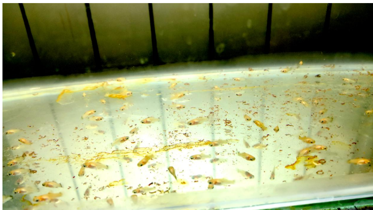
Figure 2: The fry of Xiphophorus maculatus after birth in captivity.