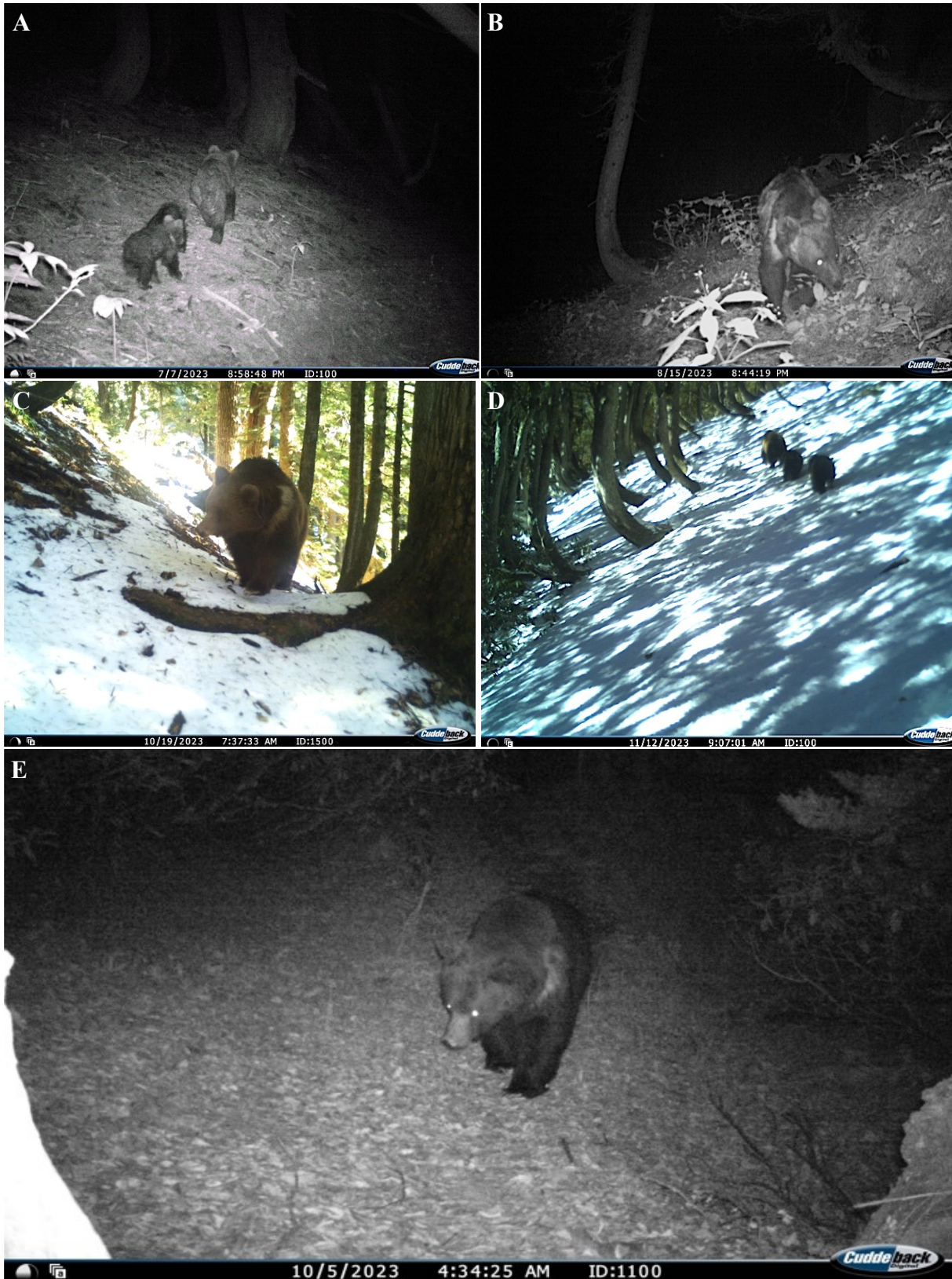
Figure 2: Camera trap images of Himalayan brown bear captured in different grids in Bani Wildlife Sanctuary, (A) an adult female with two cubs near Heiu Nallah (grid-27, 2567 m asl), (B) another adult between Thalli Nallah Forest and Somphu Forest (grid- 27, elevation 2754 m asl), (C) an adult in Dhanbiyal (grid-22, elevation 2765 m asl), (D) an adult female with two cubs in Chattri (grid-7, elevation 3465 m asl), Sudhmahadev Conservation Reserve, and (E), a sub-adult near Seoj Dhar (Sudhmahadev CR, grid-62, elevation 3230 m asl) Jammu and Kashmir, India. All images are the photo captures triggered by IR cameras.