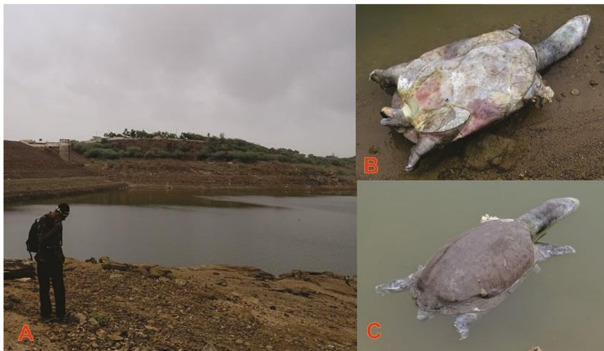
Figure 4: Dead Indian Flap-shelled turtle Lissemys punctata observed at the Rudramata Dam, Bhuj, Gujarat State, (A); habitat of the site, (B); ventral side of a dead individual, (C); dorsal side of a dead individual.