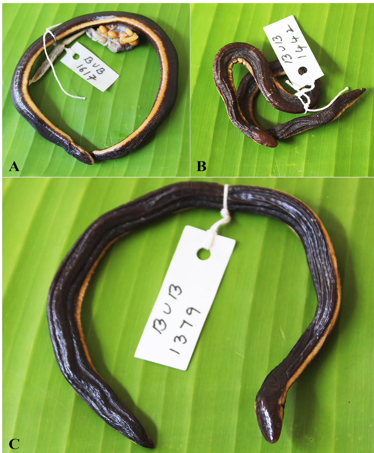
Figure 2: Adult specimens of Ichthyophis longicephalus collected from Regional Agricultural Research Station, Ambalavayal, BUB1617 (A), Kuchikunnel tea plantations, Gudalur, BUB1442 (B) and Himakshama estate, Jodupala-Made village, BUB1379 (C).

Two specimens of I. beddomei were collected from the estate and the site of collection was about 100 m away from the site of I. longicephalus .