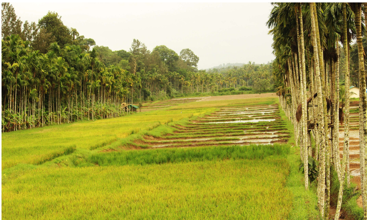
Figure 3: Paddy fields in the midst of coffee, arecanut, coconut plantations (Regional Agricultural Research Station, Ambalavayal), a habitat of collection of I. longicephalus .