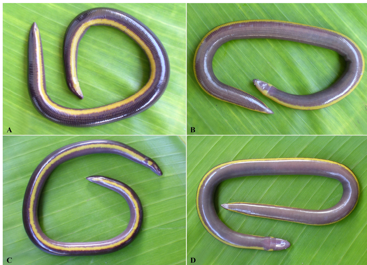
Figure 4: Congeneric species of Ichthyophis co-inhabiting along with Ichthyophis longicephalus in peninsular India: Ichthyophis beddomei , dorsal (A) and ventral (B) views; dorsum (C) and ventrum (D) of Ichthyophis kodaguensis .

1870)) (Malathesh et al., 2002; Venu and Venkatachalaiah, 2006) and one Uraeotyphlus (Venu pers. observ.).