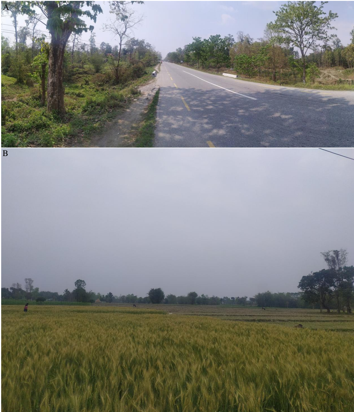
Figure 4: Habitats of two recorded specimens of Oligodon cyclurus in Morang, Nepal (A and B).