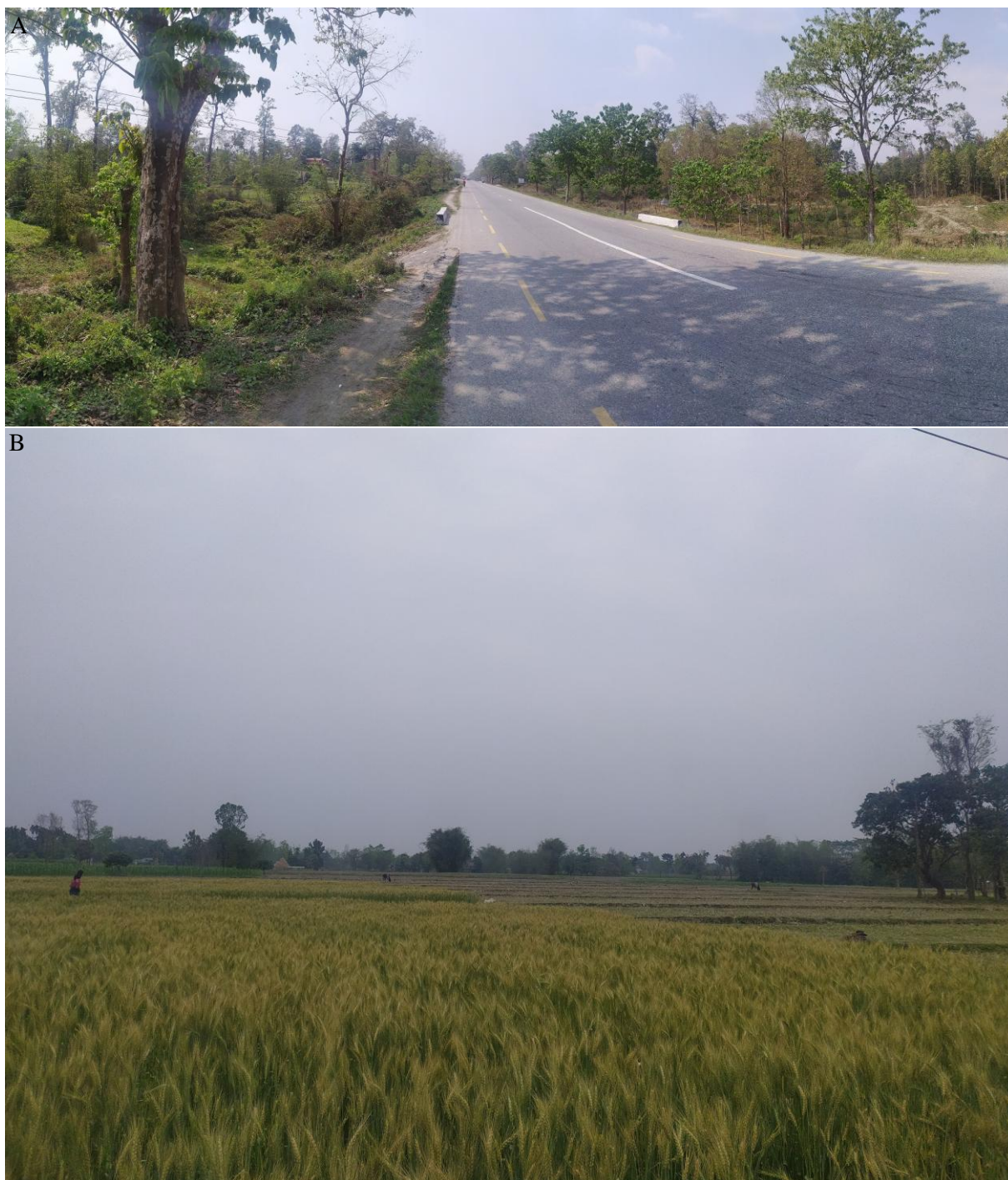
Figure 4: Habitats of two recorded specimens of Oligodon cyclurus in Morang, Nepal (A and B).

comments and suggestions. We also thank Netra Koirala for his field assistance and Sandhya Sharma for map preparation.