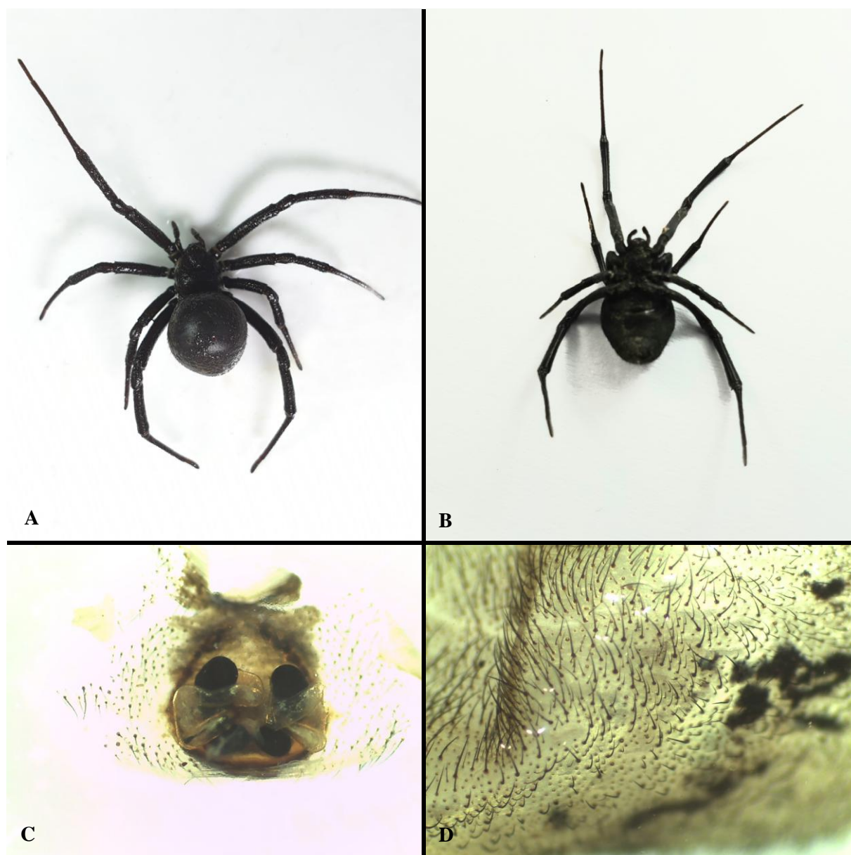
Figure 4: Latrodectus dahli Levi, 1959, from southern Iraq. Habitus of female, dorsal view (A), ventral view (B), vulva, dorsal view (C), and long and short setae on abdomen (D).