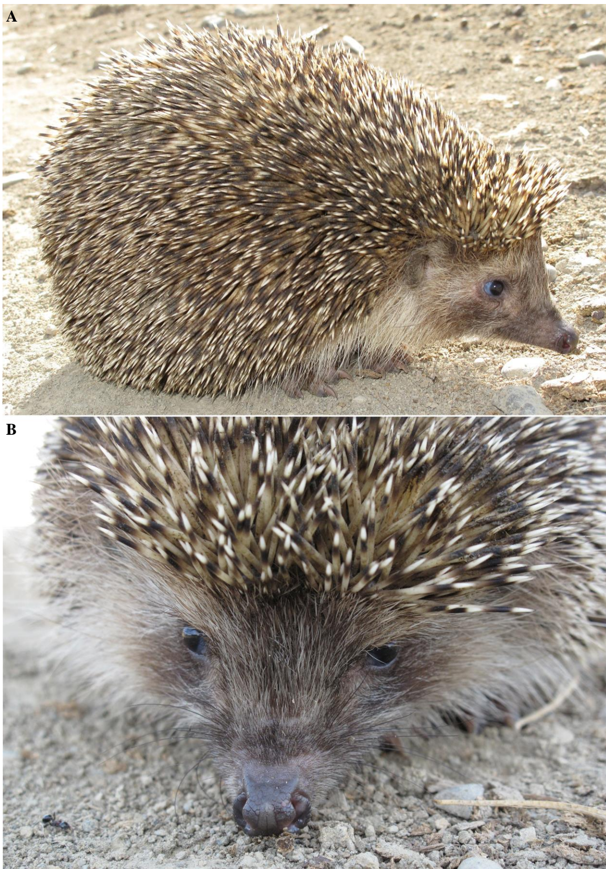
Figure 1: Erinaceus concolor (A), and its anterior region (B) from Koredestan Province.