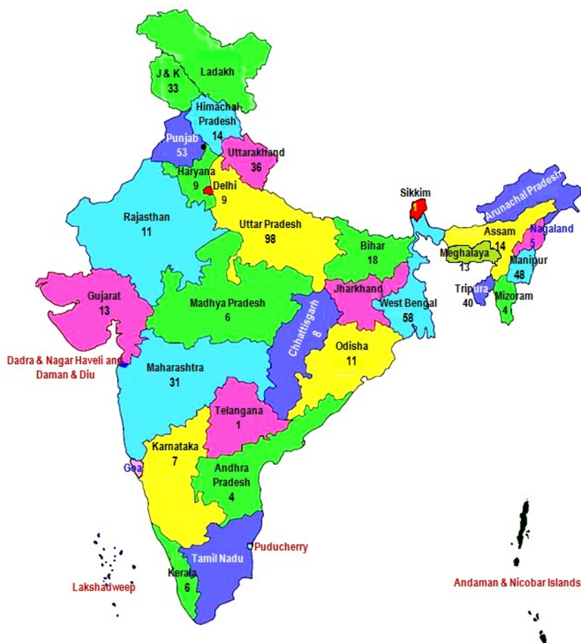
Figure 1: Map showing the number of tritrophic associations (predator-aphid host-food plant) of aphidophagous arthropods preying on Lipaphis erysimi in different states and union territories of India. https://www.mapsofindia.com