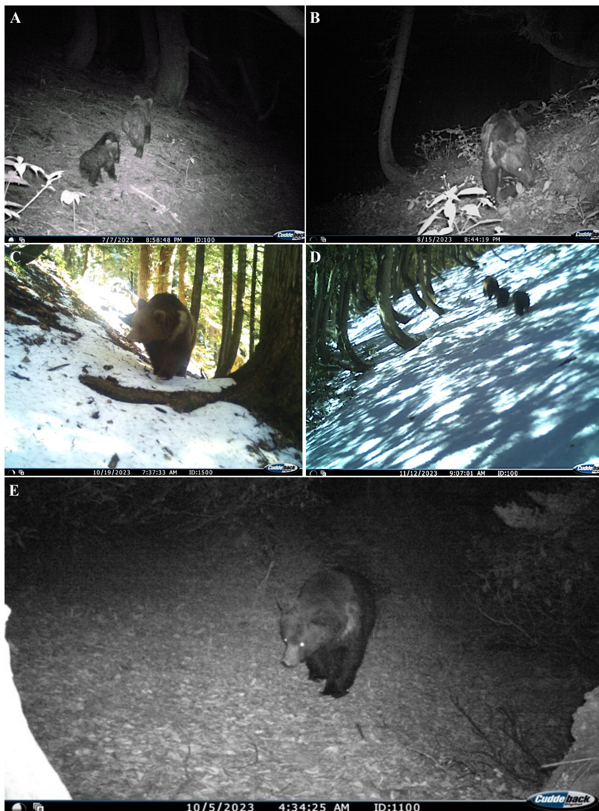
Figure 2: Camera trap images of Himalayan brown bear captured in different grids in Bani Wildlife Sanctuary, (A) an adult female with two cubs near Heiu Nallah (grid-27, 2567 m asl), (B) another adult between Thalli Nallah Forest and Somphu Forest (grid- 27, elevation 2754 m asl), (C) an adult in Dhanbiyal (grid-22, elevation 2765 m asl), (D) an adult female with two cubs in Chattri (grid-7, elevation 3465 m asl), Sudhmahadev Conservation Reserve, and (E), a sub-adult near Seoj Dhar (Sudhmahadev CR, grid-62, elevation 3230 m asl) Jammu and Kashmir, India. All images are the photo captures triggered by IR cameras.