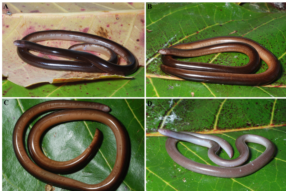
Figure 2: Portraits in life of Ramphotyphlops erebus sp. nov. (A) holotype BPBM 39683, (B) paratype BPBM 39685, (C) ventral view of paratype BPBM 39685, and (D) paratype BPBM 39684.