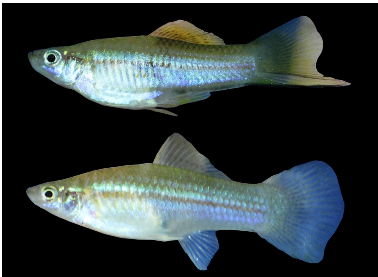
Figure 7: Xiphophorus hellerii : male (above) and female (below), from the Namak Lake basin, Iran.