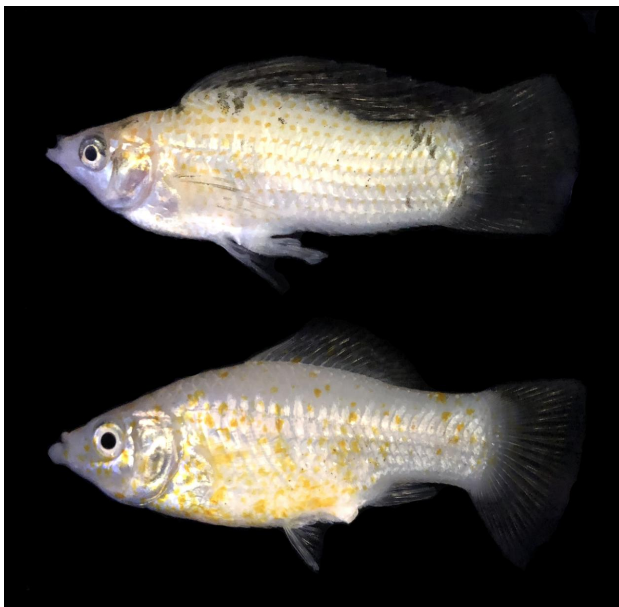
Figure 5: Poecilia latipinna : male (above) and female (below), from the Namak Lake basin, Iran.

Distribution in Iranian water basins: A single specimen of Atractosteus spatula was reported from the Marivan (Zarivar) Lake, in the Tigris River drainage, the Persian Gulf basin (Esmaeili et al., 2017).