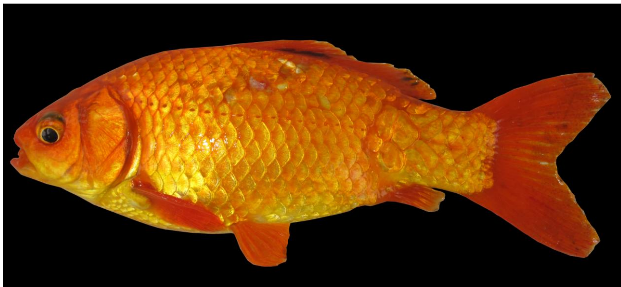
Figure 3: Carassius auratus , from the Tigris River basin, Iran.