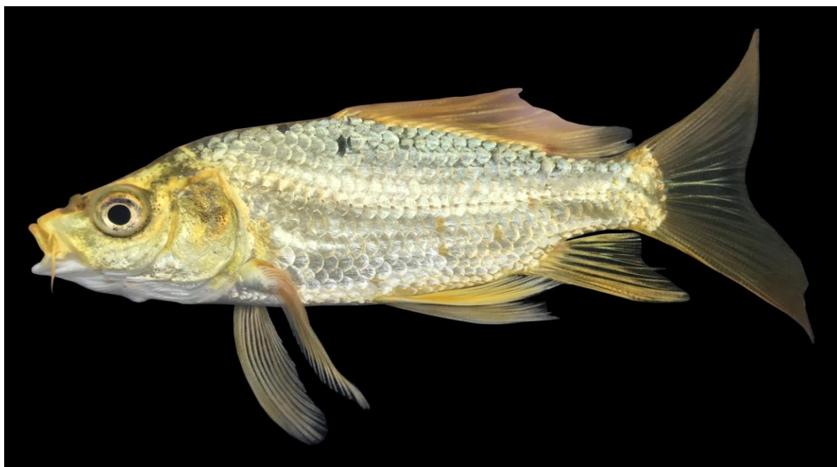
Figure 4: Cyprinus carpio , from the Namak Lake basin, Iran.