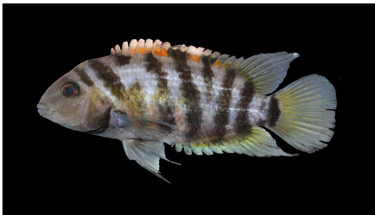
Figure 2: Amatitlania nigrofasciata : female, from the Namak Lake basin, Iran.