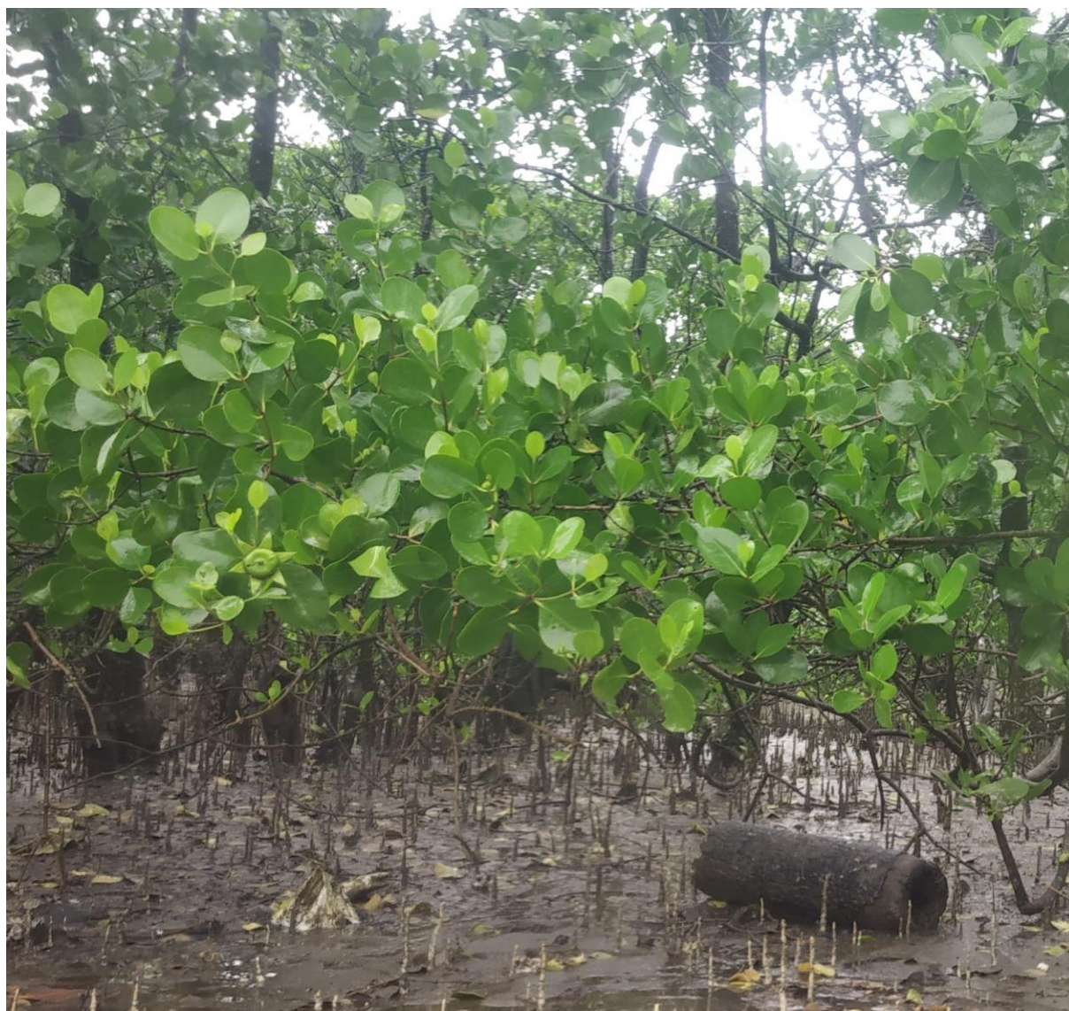
Figure 1: Mangrove habitat inhabited by Metopograpsus cannicci Innocenti, Schubart and Fratini, 2020.

Carapace flat, quadrangular, broader than long, and smooth. Lateral margins entire. Regions weakly defined, urogastric region with groove distinct, branchial region having distinct oblique ridges, cardiac and intestinal regions smooth, with no ridge or tubercles (Fig. 2a). Front broad, deflexed with rugose surface and free margin crenulated, with some concavity, 4 depressed post-frontal lobes along the line of frontal deflexion. Suborbital tooth triangular, suborbital border denticulate (Fig 2d). The exposed surface of the base of the antenna densely pubescent.